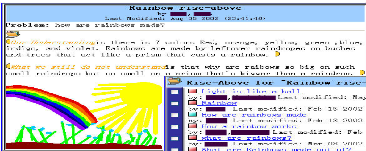
Figure 2. A rise-above note on “rainbows” in the “Colors of Light” view in Knowledge Forum.

graphics support content learning. Contributions of the current study include: (1) Coding scheme . Graphical literacy is seldom assessed in elementary schools and there are few studies to provide developmental accounts of graphical literacy. The current study provides a coding scheme that proved useful in assessing the work of students in grades 3 and 4 in an online learning environment; (2) Literacy as a by-product of knowledge building . Scardamalia (2003) proposed that knowledge building, with focus on conceptual advances related to core content, and conducted in a medium that requires multiple literacies for the expression and continual improvement of ideas, would result in increases in literacy, as a by-product of content learning. Previous studies (e.g. Sun, et al., under review) indicate this is the case for textual literacy. This study suggests that graphical literacy is another important by-product of knowledge building. A weakness of the current study is that there is no control data. Nonetheless, the study provides the basis for follow-up work aimed at assessing growth in graphical literacy, using both control data and assessments across a greater variety of classroom settings.