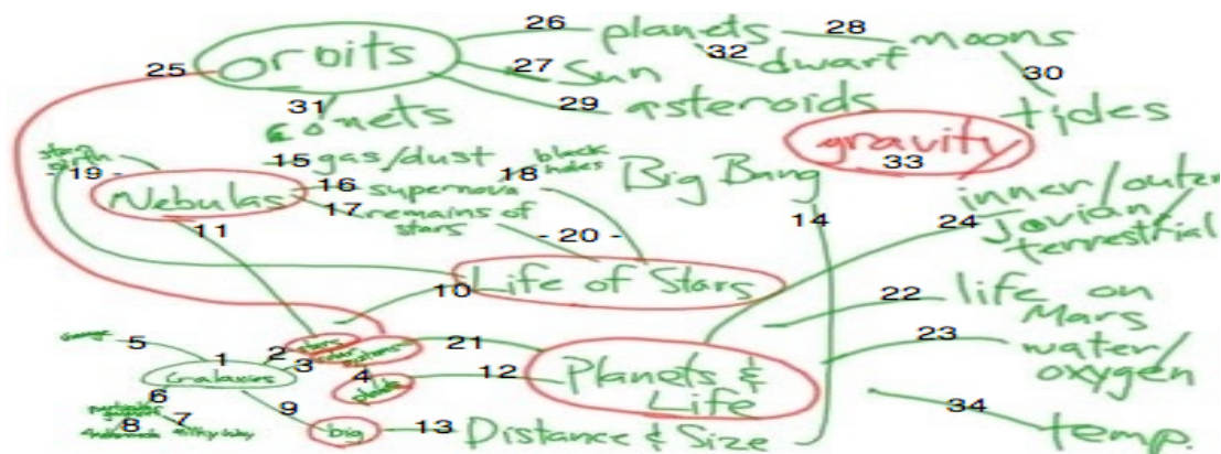
Figure 2. Concept map generated through the first metacognitive meeting in Class B. Circled terms represent major themes identified. Numbers show the sequence by which the terms and links were added.